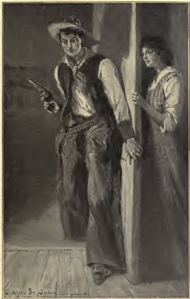
Calumet stepped in